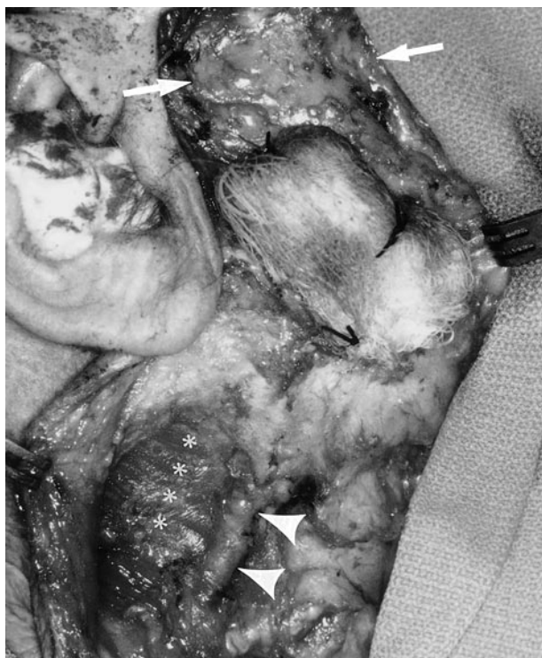
FIG 3. Intraoperative photograph (anterior is shown on the right). A gauze pad is seen overlying the tumor. The parotid gland (arrows) and sternocleidomastoid muscle (asterisks) are identified. The linear structure represents the anterior branch of the GAN (arrowheads).

lesion palpated clinically (Fig 2). This structure ended at the posterior border of the sternocleidomastoid muscle and was consistent with an enlarged anterior branch and distal main trunk of the great auricular nerve. No abnormal enhancement could be seen more proximally in the expected location of the cervical plexus or upper cervical spinal nerves.