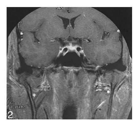
Fig 1. MR images of a 38-year-old man with numbness in the distribution of the mandibular division of the right trigeminal nerve, which occurred after a scalding injury to his tongue. Coronal high-resolution fat-suppressed, contrast-enhanced T1-weighted (600/15/2 [TR/TE/excitations]) MR images, obtained at the time of presentation, show striking enhancement and thickening of the mandibular nerve ( V3 ) at the foramen ovale ( arrow ) and upper masticator space ( arrowheads ) on the right.