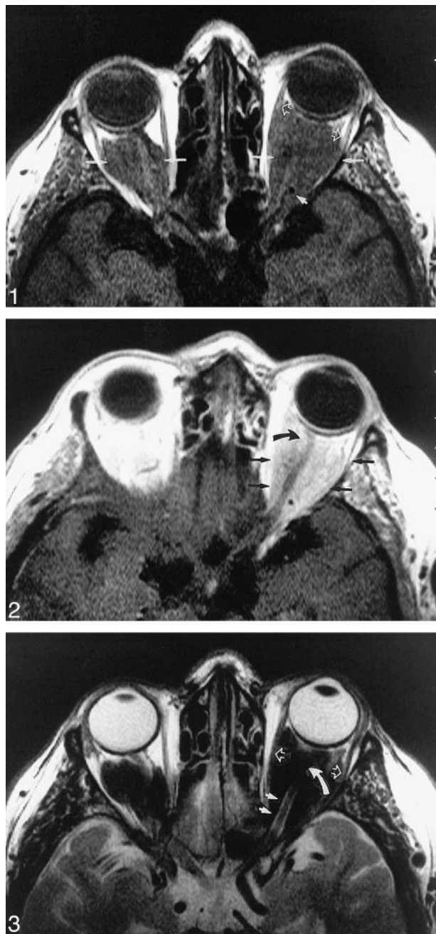
FIG 1. Axial unenhanced T1-weighted scan (507/15/4) [TR/TE/excitations] of the anterior skull base. Extensive homogeneous, bilateral, intraconal masses with low signal intensity are visible. The conal muscles are displaced laterally ( white open arrow ). The ophthalmic artery is apparent at the apex of the orbit ( small white arrow ).