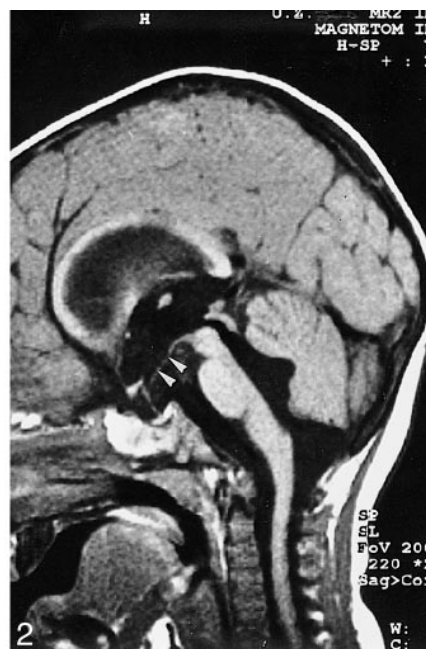
FIG 2. T1-weighted (500/12/2—repetition time/echo time/excitations) midsagittal image shows hydrocephalus with enlarged lateral, third, and fourth ventricles in a 14-month-old. Note the downward bending of the floor of the third ventricle ( arrowheads ).