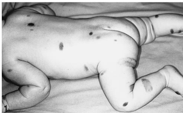
FIG 1. Multiple congenital hairy nevi are seen on a 6-month-old.