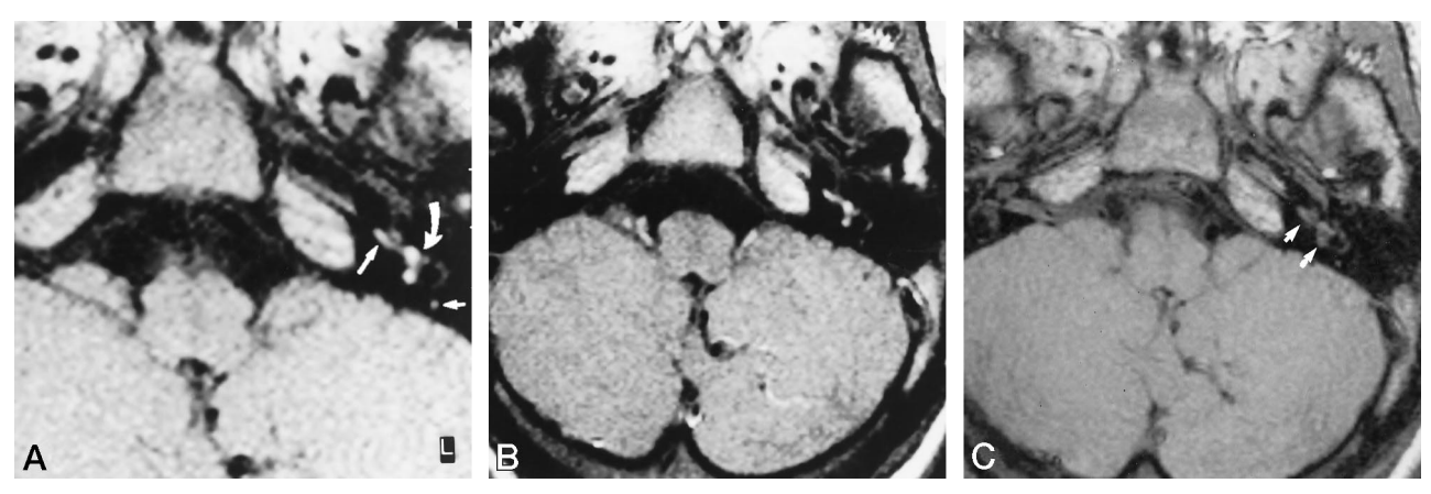
Fig. 1. Case 1.

A and B, Axial T1-weighted images (422/30/4) before (A) and after (B) contrast administration show high signal interpreted as spontaneous hemorrhage in the vestibule ( curved arrow ), cochlea ( long arrow ), and posterior crus of the posterior semicircular canal ( short arrow ) on the left. No change is evident after contrast administration.