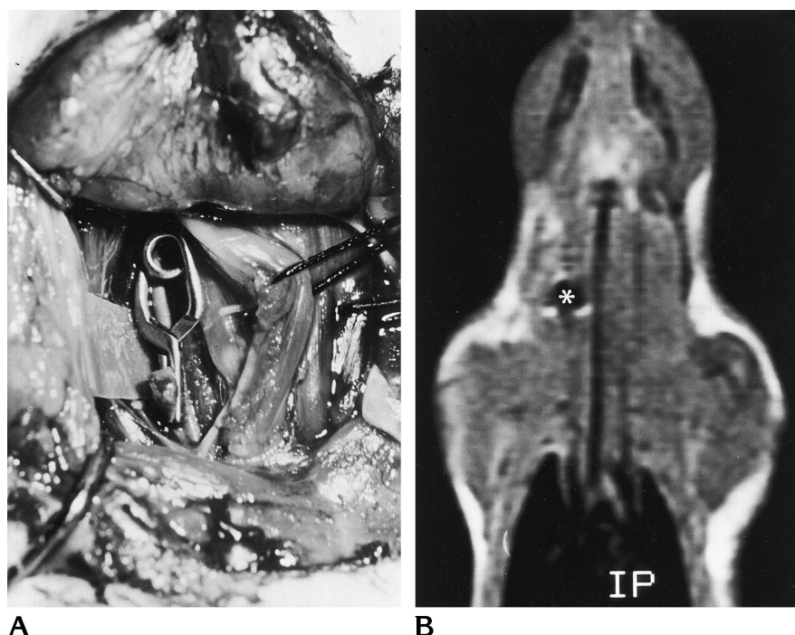
Fig 3. Intraoperative photograph (A) and corresponding coronal T1-weighted spin-echo MR image (600/15/4) (B) show site of the titanium clip implanted in a rat. The MR artifact ( asterisk ) can only be discerned around the spring, because the blades extend out of the thin section, owing to their curvature. (The esophagus, which contains air, appears in the middle as a wide, hypointense band.)

ported technique (21). Eight hours after preparation, the aneurysm was clipped at the neck using the titanium clip (see Fig 3A). Fourteen days later, an MR examination was performed with the animal under anesthesia (intramuscular neuroleptanesthesia, according to the Swiss Act on Prevention of Cruelty to Animals). Coronal spin-echo T1-weighted (600/15/4, section thickness at full width at half maximum of 3 mm, matrix of 256 \times 192 , field of view of 16 cm) (Fig 3B) and coronal fast spin-echo T2-weighted (3500/23,115/4, echo train length of 8, section thickness at full width at half maximum of 3 mm, matrix of 256 \times 192 , field of view of 12 cm) images were obtained.