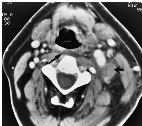
Fig 3. 55-year-old man with Hodgkin disease 5 weeks after placement of deep venous catheter for chemotherapy. Only a small amount of edema is revealed in the retropharyngeal space ( long arrow ). Left internal jugular vein thrombosis ( short arrow ).

In their textbook, Mancuso and Hanafée (8) apparently first described the CT findings in a case of edema or fluid within the retropharyngeal space after internal jugular vein thrombosis. The clinicians in this case thought the pa-