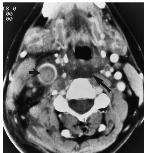
Fig 4. 60-year-old woman who presented with neck swelling 2 weeks after indwelling catheter placement. The right internal jugular vein is thrombosed and enlarged ( short arrow ). Masslike edema is in the retropharyngeal space ( long arrow ). In all patients, edema in the retropharyngeal space was not readily observable below the level of the cricoid cartilage.

Since being described by Patel and Brennan (1), the findings in this abnormality have been refined to include the presence of edema or