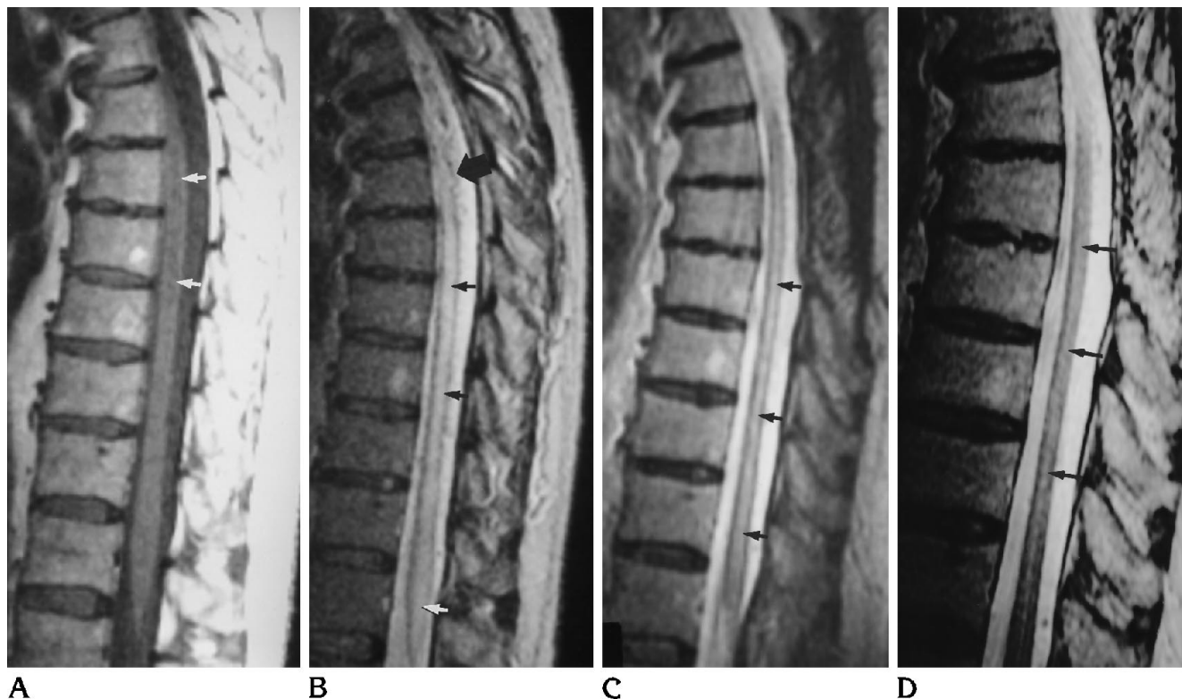
Fig 3. Case 4. A, T1-weighted sagittal thoracolumbar MR shows a subtle hypointensity within the midthoracic cord ( arrows ). B, T2-weighted MR show a dilated flow void ( thick arrow ), indistinct cord margins, and a diffuse hyperintensity within the cord extending up from the conus ( small arrows ). C, Posttreatment (9 months) T2-weighted MR shows that the cord is smaller with more distinct margins. However, the hyperintensity persists ( arrows ). D, At 34 months after treatment, T2-weighted MR shows less intramedullary hyperintensity ( arrows ).

In this review of 17 patients with proved spinal dural AVMs, all had abnormalities on MR. A diffuse hyperintensity on T2-weighted images was seen in the cord in 16 of 17 patients, extending from the conus cephalad to a variable degree. On axial images, the hyperintensity was central involving gray and white matter. This would account for the upper and lower motor neuron findings. The involvement of the conus accounts for the bladder, bowel, and sexual dysfunction. A corresponding subtle hypointensity on T1-weighted images was seen in a few patients. These signal changes are likely the result of chronic ischemia attributable to venous congestion. We found a variable degree of cord enlargement, which likely relates to the amount of edema. In 14 (82%) patients, prominent extramedullary vessels were evident and best seen on proton-density or T2-weighted images or gadolinium-enhanced images (3 of 10 patients). Two patients had "hazy" cord margins that were suspicious for dilated perimedullary vessels.