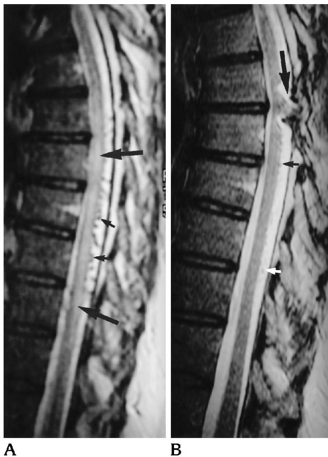
A Fig 1. Case 8. A , T2-weighted sagittal thoracic MR shows perimedullary flow voids on the dorsal aspect of the cord ( short arrows ) and a diffuse intramedullary hyperintensity ( long arrows ) that extended to the conus.

B , Posttreatment (17 months) T2-weighted MR shows resolution of the hyperintensity and only subtle flow voids on the dorsal aspect of the cord ( short arrows ). Artifact from metallic clips is seen in the high thoracic region ( arrow ).