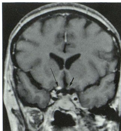
Fig. 2. Coronal enhanced T1-weighted image shows the normal nonenhancing prechiasmic optic nerve on the left (short black arrow) and the enhancing right optic nerve (long black arrow).

Two of the patients in this series received chemotherapy prior to the course of RT. Systemic chemo-