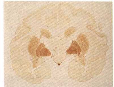
Fig. 1.—Perls-diaminobenzidine stain (no counterstain) of coronal section (30 \mu m thick) through basal ganglia of normal 1-year-old monkey shows ferritin-containing areas in brain.