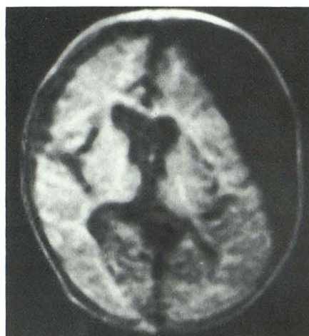
Fig. 2.—Inversion-recovery MR image (TI = 333/TR = 1545) of 15-month-old boy shows compression of left frontal horn and contralateral ventricular shift by the subdural collection.