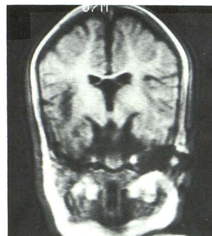
Fig. 3.—Spin-echo coronal MR image (TE = 28/TR = 500) of 15-month-old boy shows cortical atrophy and increased ventricular size.

A CT scan at 6 months of age revealed evidence of cortical atrophy. An MR scan at 15 months of age, which employed similar pulse sequences to those used for the previous two patients, revealed evidence of cortical atrophy and increased ventricular size (Fig. 3). Tortuosity of cerebral vessels was not noted.