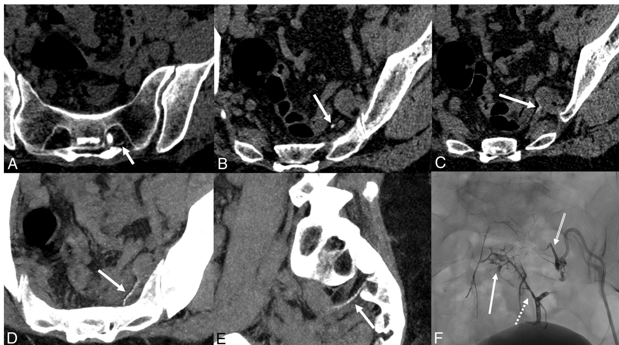
FIG 1. Left S2 CVF in patient 1. A–C, Axial images from a flat left-side-down CTM after DSM show a CVF (arrows) that arises from a left S2 nerve sheath diverticulum that empties into the left internal iliac vein. These images were reconstructed into 0.625-mm-thick slices from the 50-keV monoenergetic reconstructions from DECT. D and E, Multiplanar reformatted images from the CTM highlight the CVF (arrows). F, Postprocedural frontal projection image from transvenous catheter Onyx (Covidien) embolization of the CVF. The left S2 vein (double-line arrow), left S3 vein (broken arrow), and the pelvic epidural venous plexus (solid arrow) are opacified.

performed approximately 20 minutes after the DSM. On the inferior-most images, a CVF arising from a right S3 diverticulum was partially visualized, which, in retrospect, could be seen on the conventional CTM. A repeat DSM was performed several days later, this time with the patient in the reverse Trendelenburg position to opacify the CVF (Fig 2). Immediate post-DSM DECT in a flat right lateral decubitus position depicted the CVF as it arose from a complex multilobulated right S3 diverticulum and connected to the ipsilateral internal iliac vein. The patient encounter occurred before the advent of transvenous embolization, and the patient underwent a CT-guided epidural blood patch with fibrin glue. The patient had symptom relief for 1.5 years and is currently undergoing evaluation for a recurrent CSF leak.