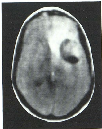
Fig. 2.—Axial transverse NMR scan in patient with giant middle cerebral artery aneurysm. Persisting lumen is a dark cleft posteriorly with laminated clot anteriorly. There is considerable edema anterior and medial to aneurysm.

(B) CSF appears white (see text). Position of aneurysm and its relation to other brain features are well shown on coronal (C) and sagittal (D) sections.