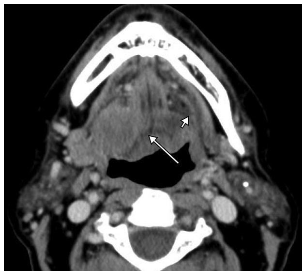
FIG 4. Axial contrast-enhanced CT at the floor of mouth level. Clinically, this tumor was staged as T2 right oral cavity squamous cell carcinoma because there was mucosal ulceration and a >2-cm palpable mass. However, there is invasion of the lateral and posterior genioglossus muscle ( long arrow ). Note a normal hyoglossus muscle on the left ( short arrow ); tumor has completely replaced right hyoglossus muscle. This is upstaged to T4a on the basis of CT findings, changing the prognosis and treatment.