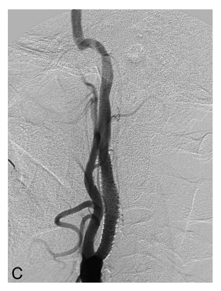
Fig 1. An example of intraplaque hemorrhage seen on a TOF source image in a 71-year-old man with a left cerebral ischemic event. A , Axial source image of TOF MRA shows the IPH (short arrows) in the eccentric left carotid plaque, which surrounds the lumen of the internal carotid artery with severe stenosis. IPH is identified as a hyperintense signal intensity compared with the adjacent neck muscle. B , Lateral projection of a left carotid angiogram shows long segmental severe stenosis in the proximal cervical portion of the left internal carotid artery. C , Postcarotid artery stent placement angiogram shows minimal residual stenosis at the origin site of the left internal carotid artery.