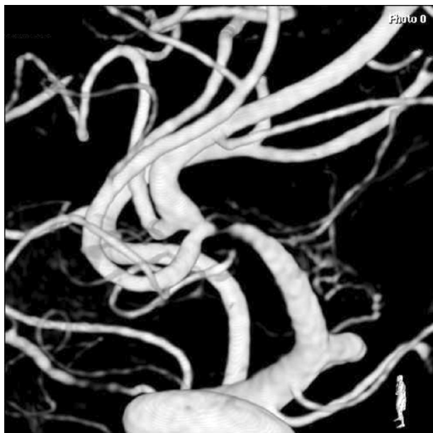
Fig 1. Pretreatment 3DRA image of 96% stenosis at the distal M1 segment of the MCA (2.5-mm diameter).

location of the intracranial stenosis corresponded to the vascular territory of the ischemic event, 4) the degree of intracranial stenosis was \geq 70\% for patients presenting with a first episode of cerebral ischemia (Fig 1), 5) the degree of intracranial stenosis was \geq 50\% for patients with recurrent cerebral ischemia despite medical therapy, and 6) the diameter of the vessel immediately adjacent to the stenosis was \geq 2 mm. Patients were divided into 2 groups for comparison: Those with MCA stenosis were allocated into the study group, and the remainder into the control group.