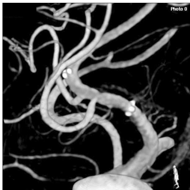
Fig 2. Image of the same lesion immediately after angioplasty with a 2-mm balloon and placement of a 3 × 15 mm Wingspan stent.

based on an oversize of the native diameter of the target vessel by 0.5–1.0 mm and an extended stent length by 3 mm on either side of the lesion (Fig 2). 12,20