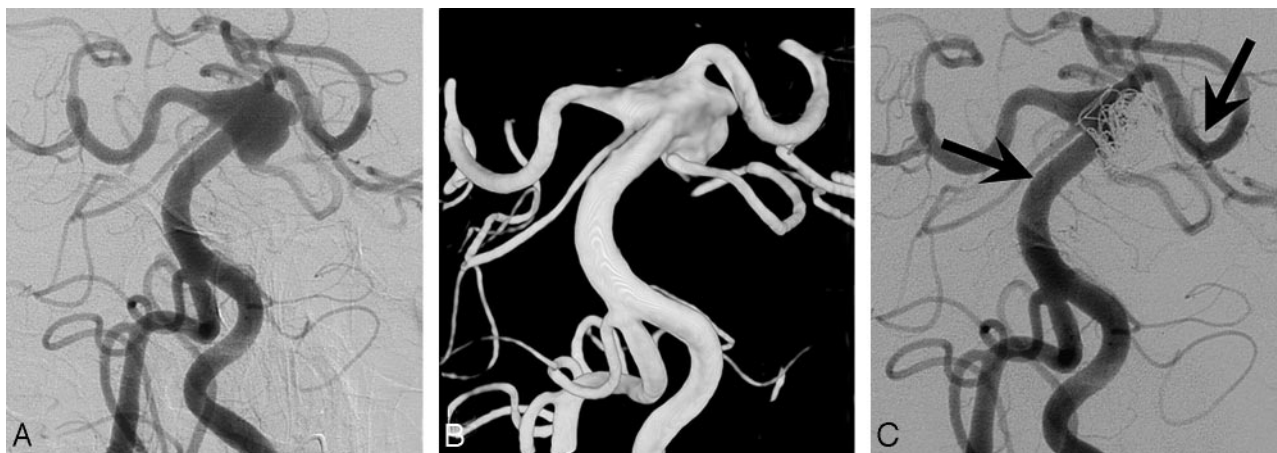
Fig 2. A 58-year-old woman with a ruptured superior cerebellar artery aneurysm without a neck. A and B , 2D and 3D vertebral angiograms demonstrate the dysplastic distal basilar segment with a large superior cerebellar artery aneurysm. The superior cerebellar artery arises from base of the aneurysmal sack, and the dysplastic segment extends to the proximal posterior cerebral arteries. C , Result after stent-assisted coiling. Proximal and distal stent markers are indicated by arrows. Flow in the superior cerebellar artery is preserved.