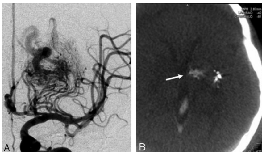
Fig 3. Left ICA angiogram after second session of embolization shows marked reduction in the size of nidus with slow opacification of the draining veins (A). CTA performed with microcatheter injection in the thalamostriate feeder showed opacification of internal capsule (arrow) medial to the glue cast (B).