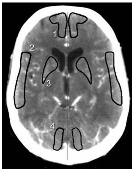
Fig 1. Analysis of manual outlined ROIs according to territorial division of Damasio. 26 1, ACA territory; 2, MCA territory; 3, basal ganglia; 4, PCA territory.