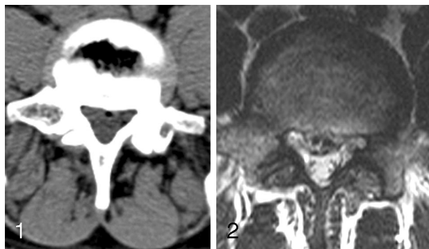
Fig 1. An axial CT scan reveals posterior disk herniation containing air. Vacuum phenomenon was also noted within intervertebral disk space.