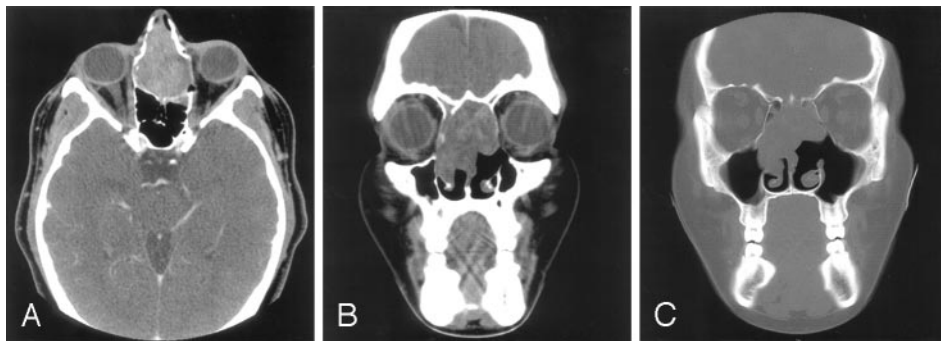
Fig 1. A, Axial contrast-enhanced CT image shows an expansile mildly enhancing soft-tissue mass in the anterosuperior nasal cavity.

B, Coronal CT image shows the mass causing mild remodeling of the medial orbital walls and extension up to the level of the cribriform plate.