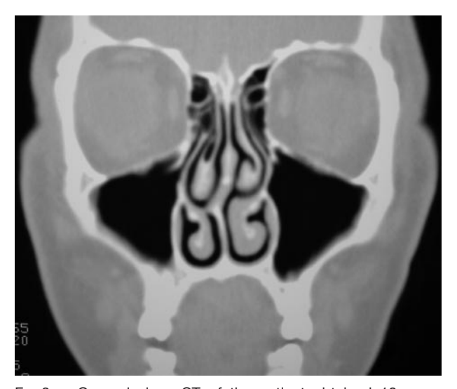
Fig 3. Coronal sinus CT of the patient obtained 10 years previously, before nasal septal reconstruction and rhinoplasty with lateral osteotomies, shows normal sinuses.

opmentally small sinus with chronic obstructive sinusitis was the cause (3). The acquired nature of this condition, however, is now well recognized. Negative intrasinus pressure has been demonstrated in patients with silent sinus syndrome (5). Obstruction of the sinus ostium is always present, but it is not clear whether this is the cause or the result of sinus wall