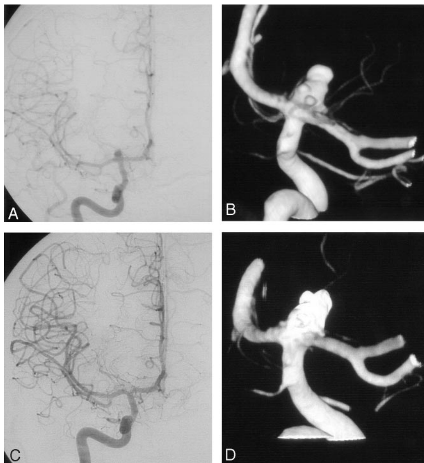
FIG 3. SAH in a 33-year-old woman.

A and B, Conventional (A) and 3D (B) angiograms of the right ICA obtained before treatment show an ICA bifurcation aneurysm with multiple daughter sacs.