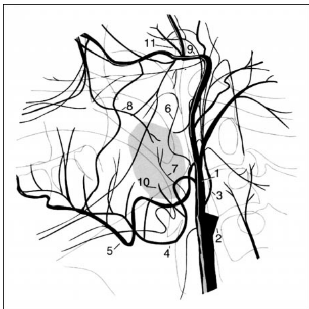
FIG 3. Drawing shows major arterial supply to the palatine tonsil and adenoidal area. 1, ECA; 2, ICA; 3, ascending pharyngeal artery; 4, lingual artery; 5, facial artery; 6, ascending palatine artery; 7, tonsillar artery; 8, descending palatine artery; 9, internal maxillary artery; 10, dorsal lingual artery; 11, accessory meningeal artery.

to surgical technique (2). Our patient with secondary PTAH presented to our hospital 14 days postoperatively. A number of factors have been suggested as increasing the risk of secondary PTAH, including elevated postoperative mean arterial pressure, excessive intraoperative blood loss, older age, a history of chronic tonsillitis, and use of nonsteroidal anti-inflammatory drugs (4, 10).