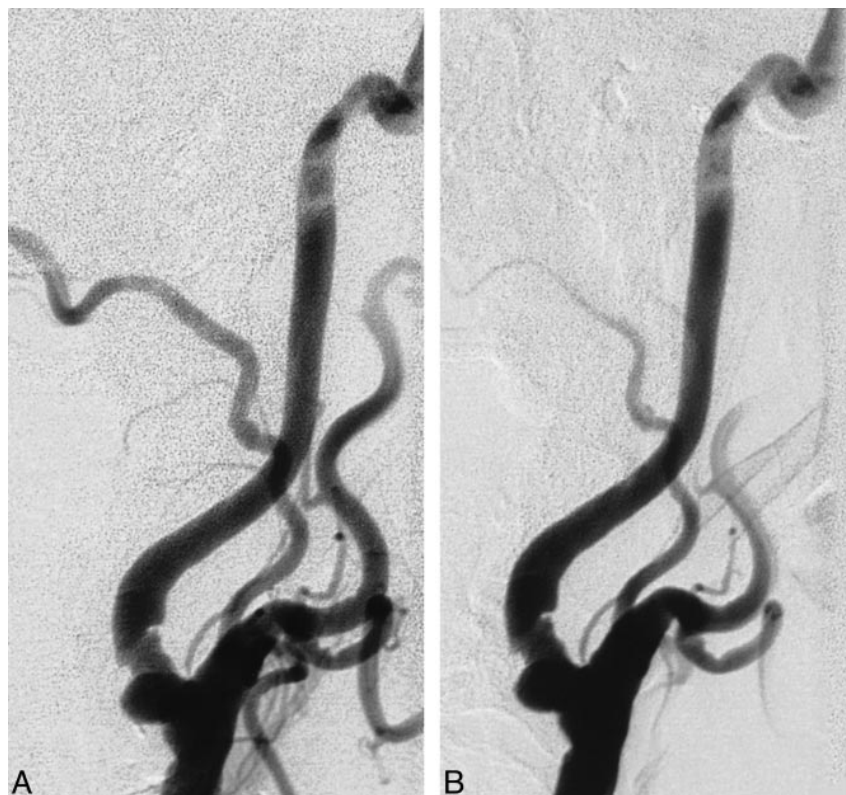
FIG 4. A and B, Gadolinium- (A) and iodine-based (B) common carotid arteriograms. Lateral injections are nearly identical, except that the gadolinium examination has increased graininess due to film contrast.

during the gadolinium injection, an experience that none of our patients reported.