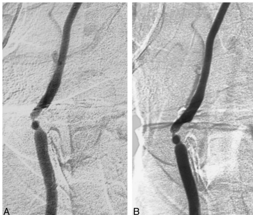
FIG 3. A and B, Gadolinium- (A) and iodine-based (B) frontal projections of common carotid arteriogram. Although the depiction of vascular anatomy is equivalent, there is relatively decreased intravascular contrast on the gadolinium examination.