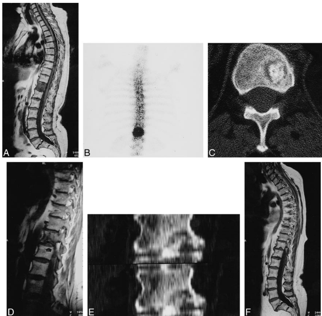
FIG 1. A 68-year-old woman with acute back pain of 15-day duration. Schmörl's node formation with herniation of calcified disk. A, T1-weighted image spin-echo (600/15 [TR/TE]) shows diffuse low signal intensity in the T11 vertebral body and spondylolisthesis of L5–S1. T2-weighted spin-echo image (2200/80) shows only slight increase in signal intensity near inferior endplate ( arrow ). B, Increased uptake on bone scintigraphy over T11 vertebra 6 days later. C, CT scan depicts a radiolucent lesion in lower portion of T11 with central dense bone 14 days later. D, Small defect ( arrow ) in inferior vertebral endplate of T11 and decrease in vertebral hypointensity on T1-weighted spin-echo image (500/15) 3 months later. E, CT coronal reformatted images. Disk calcification herniating through vertebral bony defect. F, T1-weighted spin-echo image (460/17) and T2-weighted spin-echo image (5000/112) ( arrow ) show a typical Schmörl's node at 1-year follow-up.

weakness in the endplate. The endplate defect may occur during development (through the vascular channels, through the region of the regressed chorda dorsalis, or through ossification gaps in the first and second decades of life), or may occur because of a weakening of the cartilaginous endplate or the subcondral bone by Scheuermann's disease, infection, metabolic disorders, neoplasms, degenerative disease, or traumatic lesions caused by compressive vertebral loads (1). The weakened endplate area has less resistance to the expansive pressure of the adjacent nucleus pulposus. The pressure decreases with age, and this accounts for the fact that Schmörl's node formation occurs more rapidly in