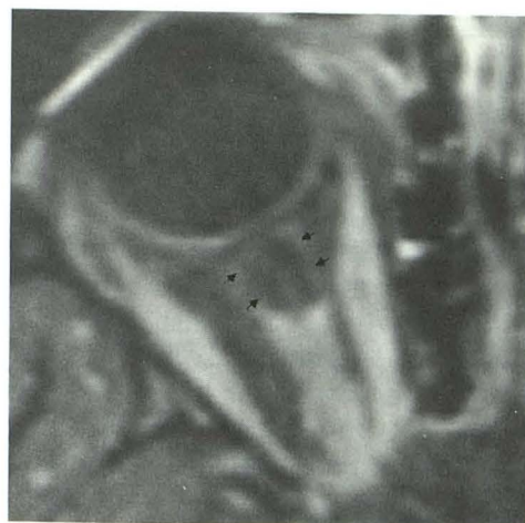
Fig. 3. T1-weighted (600/20/2) post-gadolinium 3-mm axial scan (obtained with fat suppression) demonstrates meningioma of the posterior two thirds of the right optic nerve sheath. Anterior to the meningioma there is dilation of the optic nerve sheath (arrows). In the central portion of the dilated nerve sheath is an atrophic optic nerve.