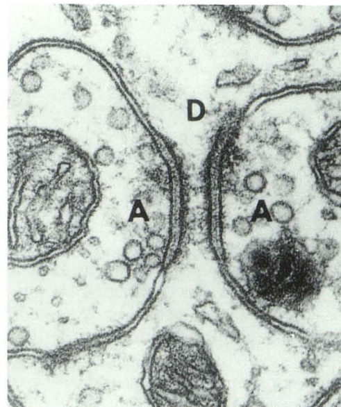
Fig. 2. Electron micrograph of a crest synapse. Two axons (A) form parallel, coextensive synaptic contacts on a narrowed dendritic process (D). Modified from Lenn (20).

Experimentally, creating a lesion in one MH will cause the death of axons arising from that side. Such axonal death removes the synaptic input from these neurons and axons. This is called deafferentation. Two months after normal adult crest synapses are deafferented by a lesion in one MH, 66% or more of remaining synapses are formed by two MH axons that are (necessarily) from the same, unlesioned MH (22). That is, in adults , axons from the intact MH appear to grow in to maintain the synapses, but, necessarily the two synapses of the pair are formed with axons from the same—sole remaining—side. This is an impressive degree of reactive reinnervation compared to other brain regions. However, when the MH lesion is made in newborn rats, before the initial appearance of crest synapses, the result is even more vigorous. Under these conditions, 96% of crest synapses are formed by two MH axons by 28 days (23), more than in the lesioned adult or the normal animal at this age (24).