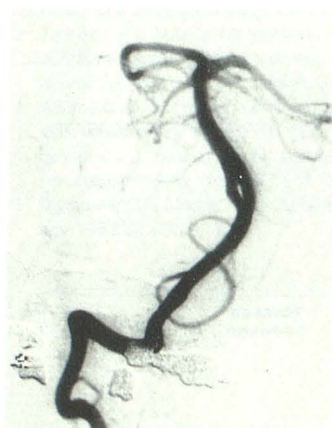
Fig. 4.—Intracranial vascular opacification after selective catheterization of right vertebral artery with use of Tomac-3 catheter. Good visualization of posterior inferior cerebellar artery, anterior inferior cerebellar artery, superior cerebellar arteries, and posterior cerebral arteries is achieved. (3 ml of contrast medium at flow rate of 5 ml/sec.)

The opacification of small intracranial branches of the carotid artery as well as that of the basilar artery can be attained (Fig. 4). We were able to selectively catheterize the left subclavian artery in 100% of the cases and the left carotid artery in 95% of the cases. Semiselective angiography of the left vertebral artery with the tip of the catheter positioned close to the vertebral origin was successful in all cases. The right carotid artery was selectively catheterized in 85%, and semiselectively in the other 15%. The right vertebral artery was selectively catheterized in 88% of the patients, while in 12% good opacification was achieved by the semiselective technique.